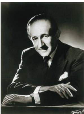
Anatole Fistoulari

1961 is the year Bernard Haitink was appointed chief conductor of Royal Concertgebouw Orchestra, a post that he would share with Eugen Jochum. In February of the same year, Decca held a stereo session in which Mahler’s Symphony