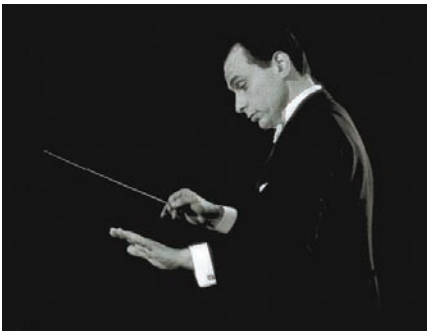
Lorin Maazel

Producer: John Culshaw Engineer: Gordon Parry Location: Sofiensaal, Vienna Recording date: September 1963 (Symphony), March 1963 (Suite)